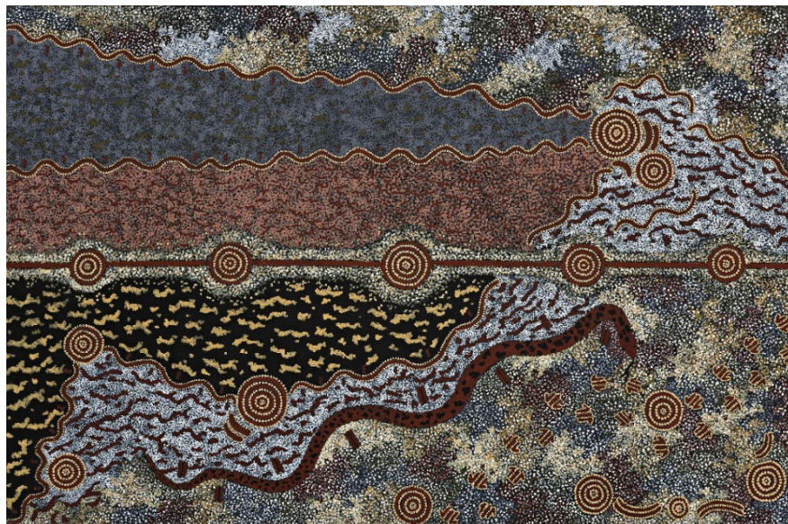
Michael Jagamara Nelson, Five Stories , 1984. Acrylic on canvas, 48 x 71 5/8 in. (121.9 x 182 cm). Courtesy the Parker Foundation © Estate of the artist. Licensed by Aboriginal Artists Agency Ltd. Photo: Tom Cogill

Exhibition reflects on the fifty-year history of Papunya Tula Artists, Australia's oldest Aboriginal-owned arts organization