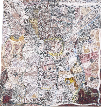
Johnny Warangkula Tjupurrula, Water Dreaming at Kalipinyapa , 1972. Synthetic polymer paint on composition board, 31 3/4 x 29 3/4 in. (80.6 x 75.6 cm) Collection of John and Barbara Wilkerson © Estate of the artist. Licensed by Aboriginal Artists Agency Ltd.

together into a single, coherent image, five different ancestral narratives that intersect on the artist's homelands. Johnny Warangkula's Water Dreaming at Kalipinyapa is part of the artist's well-known series, Water Dreamings , inspired by the heavy rains in Papunya at the time. Using sinuous strokes and shimmering dotting, Johnny Warangkula captured the presence of abundant plant life following desert rains, cementing the dot as a defining feature of Aboriginal art more than any other artist. The painting's historical significance is underscored by the fact that it twice made Australian national headlines when it sold for world-record auction prices in the 1990s and 2000s.