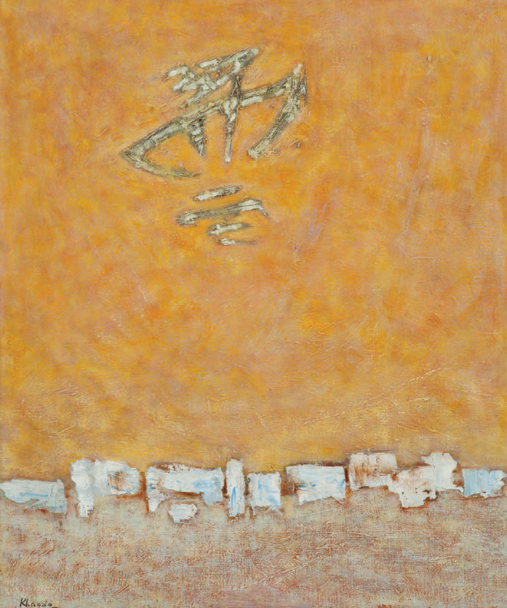
Mohammed Khadda (Mostaganem, Algeria, 1930–Algiers, 1991), “Abstraction vert sur fond orange” (Green Abstraction on Orange Background), 1969, Oil on canvas, 28 3/4 x 23 5/8 in. Collection of the Barjeel Art Foundation, Sharjah, UAE From the exhibition Taking Shape: Abstraction from the Arab World, 1950s–1980s