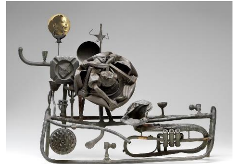
Shinkichi Tajiri, Lament for Lady (for Billie Holiday) , 1953. Brass, bronze, and photograph, 24 x 33 x 13 3/8 in. Collection of Giotta Tajiri and Ryu Tajiri, Baarlo, Netherlands. © 2023 Artists Rights Society (ARS), New York / c/o Pictoright Amsterdam

The exhibition covers a 17-year period beginning in 1946, when the U.S. Embassy in Paris began processing applications from ex-service members for the new GI Bill. A monthly stipend of $75 allowed expats to live fairly comfortably in postwar Paris, which was still recovering from the Nazi occupation. Enrollment in the city's numerous ateliers was not only easy, but was paid for by the GI Bill. Modern masters such as Ferdinand Léger and Ossip Zadkine, as well as schools such as the Académie de la Grande Chaumière and Académie Julian, welcomed Americans, whose tuition provided a steady income stream. Study in Paris offered the opportunity to visit the capital's famed museums and to hang out in its legendary cafés frequented by the likes of Alberto Giacometti, Simone de Beauvoir, and Jean-Paul Sartre. In 1950, American artists even established their own cooperative gallery, Galerie Huit, named for its address at 8, rue Saint-Julien-le Pauvre on the Left Bank.