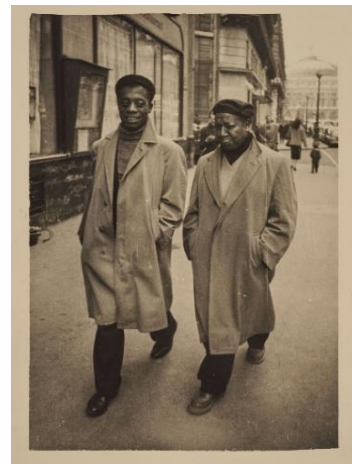
James Baldwin and Beauford Delaney, Paris, c. 1960