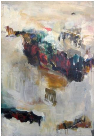
Shirley Jaffe, Untitled , 1954. Oil on canvas, 60 x 41 1/2 in. National Academy of Design, New York. © 2023 Artists Rights Society (ARS), New York / ADAGP, Paris

That abstraction also took an entirely different turn from gestural, painterly compositions is seen in Ralph Coburn’s semaphore-like Aux Bermudes (1951–52); Ellsworth Kelly’s Fond Jaune (1950), where fragmented forms balance delicately on a yellow ground; and Carmen Herrera’s elegant Curves: Orange, Blue and White , 1949. Figuration was present, too, as is seen in Barbershop (1950), by Haywood “Bill” Rivers, wherein the Black North Carolina-reared artist renders a scene from the American South in an impastoed faux-naïf style. In Shinkichi Tajiri’s Lament for Lady (for Billie Holiday) (1953), the sculptor creates a disjunctive assemblage of industrial cast-offs that combines symbolic elements, like a bent-and-crumpled brass gardenia, with an actual photograph of the jazz icon.