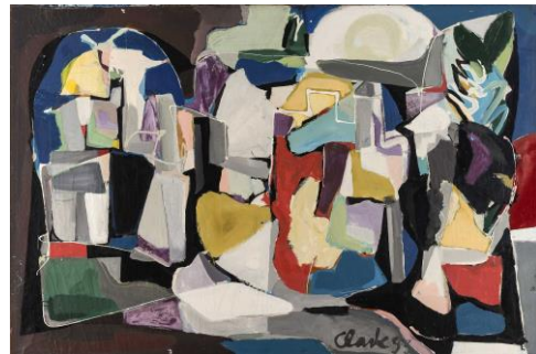
Ed Clark, The City , 1952. Acrylic on canvas, 51 x 78 1/2 in. Collection of Melanca Clark, Detroit. Courtesy Hauser and Wirth. © Estate of Ed Clark. Photo: Hollister and Young, Michigan Imaging

Intense experimentation among these closely knit, if shifting, circles of artists generated a variety of formal inventions and personal artistic styles. Visitors to Americans in Paris will encounter such works as The City (1952), by Ed Clark, a vibrant large-scale painting where primary and secondary colors collide like bumper cars; an abstract painting by Shirley Jaffe that wrests an individual imprint from the period’s default style; and masterly works by Joan Mitchell, all explosions and tangles of paint skeins in her inimitable palette.